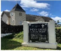
Holy Cross Church Humility