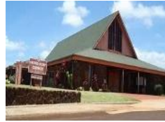
Sacred Heart Mission Church

2-2370 KAUMUALII HWY, P.O. BOX 487, KALAHEO, HI 96741 Email: holycrosschurch@hawaii.rr.com HOURS: 8 AM-12 NOON, M-F