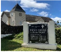
Holy Cross Church Humility