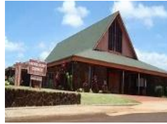
Sacred Heart Mission Church

2-2370 KAUMUALII HWY, P.O. BOX 487, KALAHEO, HI 96741 Email: holycrosschurch@hawaii.rr.com HOURS: 8 AM-12 NOON, M-F