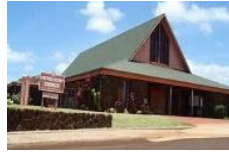
Sacred Heart Mission Church

2-2370 KAUMUALII HWY, P.O. BOX 487, KALAHEO, HI 96741 Email: holycrosschurch@hawaii.rr.com HOURS: 8 AM-12 NOON Church Office: 808-332-8011 Fax: 808-332-7749