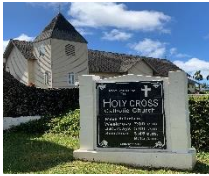
Holy Cross Church